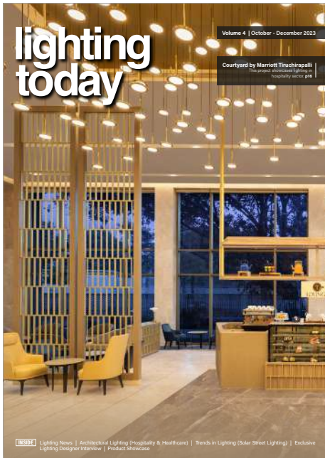
ON THE COVER: Courtyard by Marriott Tiruchirapalli