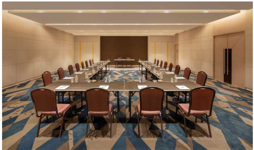
Nanjai Banquet Hall