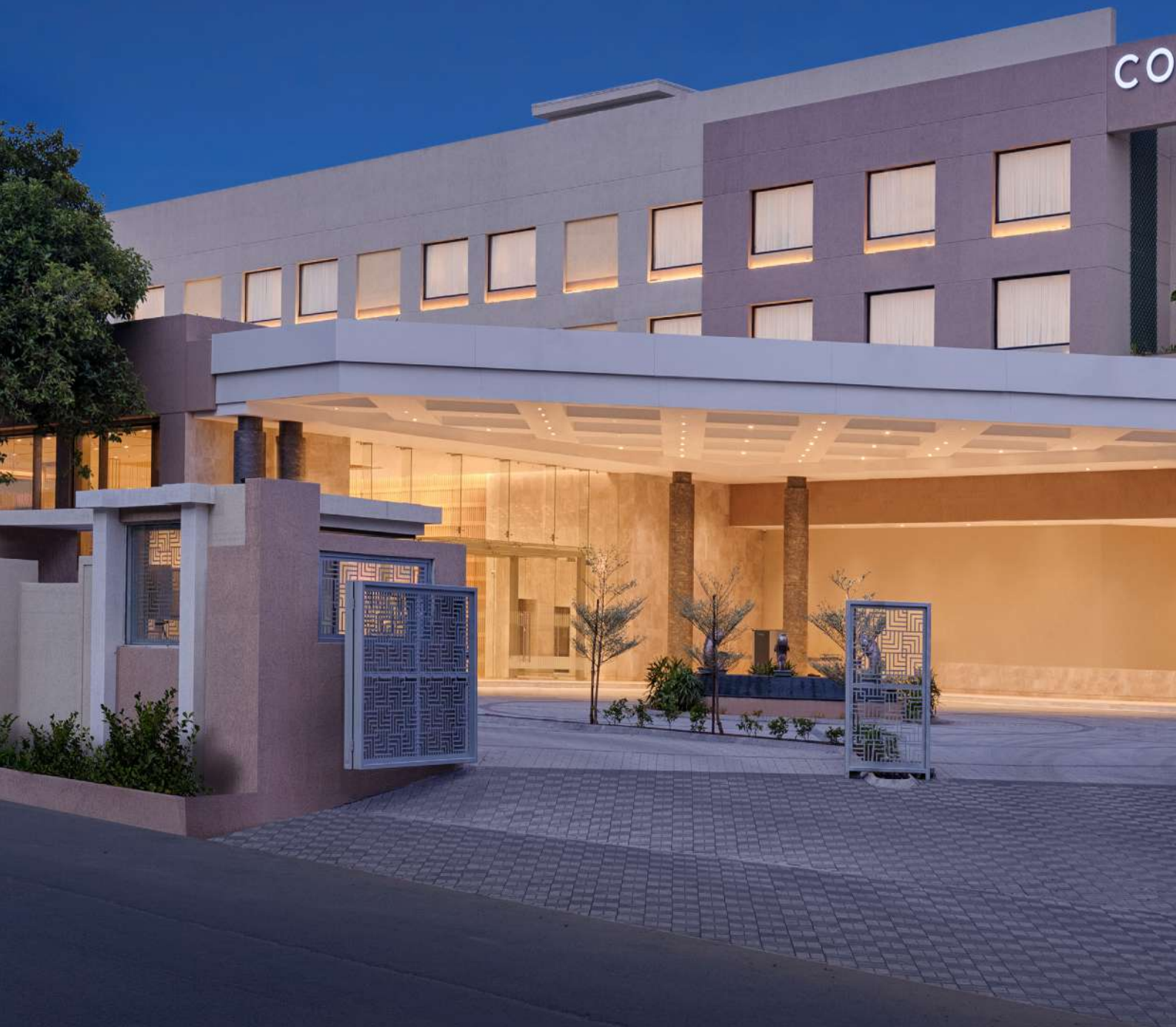
Facade of Courtyard by Marriott Tiruchirapalli.