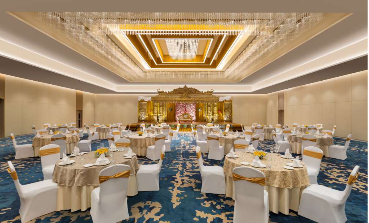
Vasantham Banquet Hall

Tiruchirappalli is the fourth largest city in Tamil Nadu, situated on the banks of the river Cauvery. It is a fine blend of tradition and modernity built around the Rock Fort, a citadel of the early Cholas which later fell to the Pallavas. The Rockfort Temple, a spectacular monument perched on a massive rocky outcrop which rises abruptly from the plain to tower over the old city is the most famous landmark of this bustling town. The Sri Ranganathaswamy Temple built on an island in the middle of Cauvery River is another landmark in its vicinity renowned for being one of the largest and most interesting temple complexes in India. Given the overpowering context of the Rockfort and Srirangam temples, the contemporary design of the recently renovated Courtyard by Marriott at Tiruchirappalli had to reflect a storyline of architectural elements derived from these temples. The storyline is continued throughout the hotel by layering and repeating the patterns such as rectilinear patterns to create an impactful illusion.