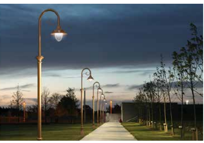
Note: Technical amendments reserved

Light Source: LED / CFL. Varied wattage Options