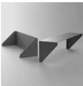
Anti Glare Shield