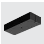
Canopy Kit for Dimmable options