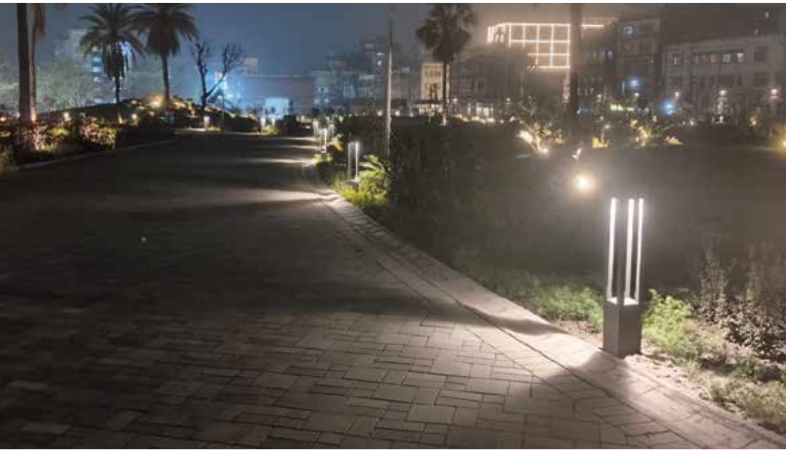
BOTANICAL GARDEN PARK, GUWAHATI