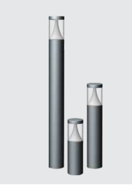
SMART CITY, TRICHY