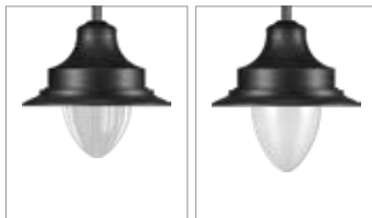
A9 - Clear Acrylic