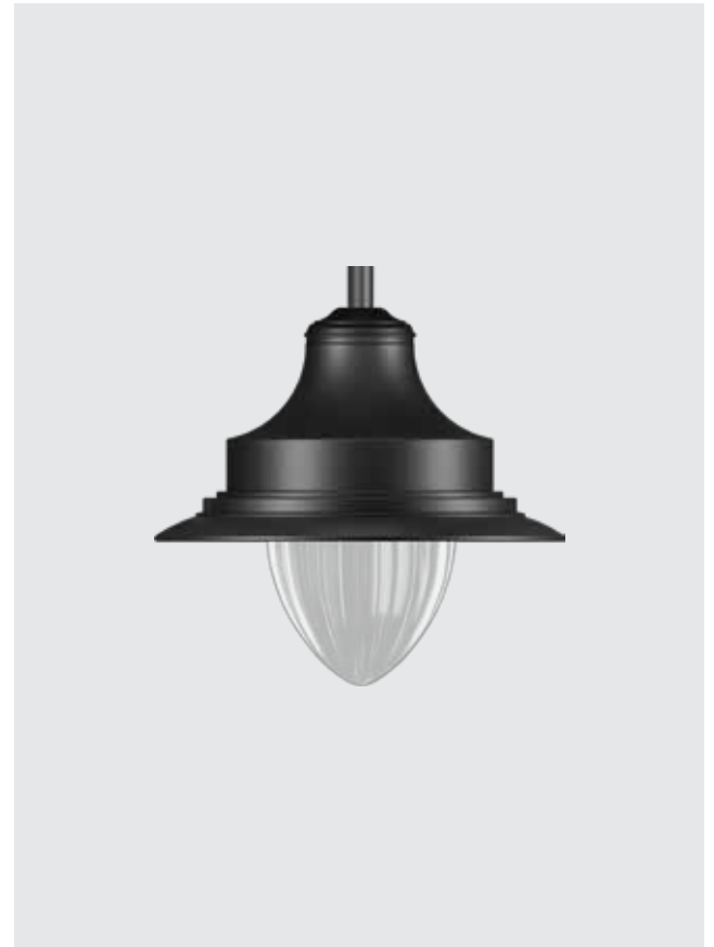
A12 - Clear Polycarbonate