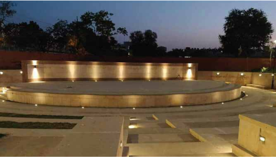
JDA WONDERLAND PARK, JAIPUR