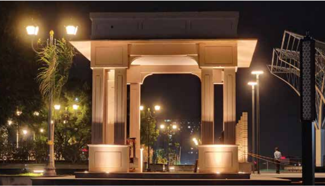
CITY PARK, JAIPUR