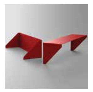
Anti - Glare Visor