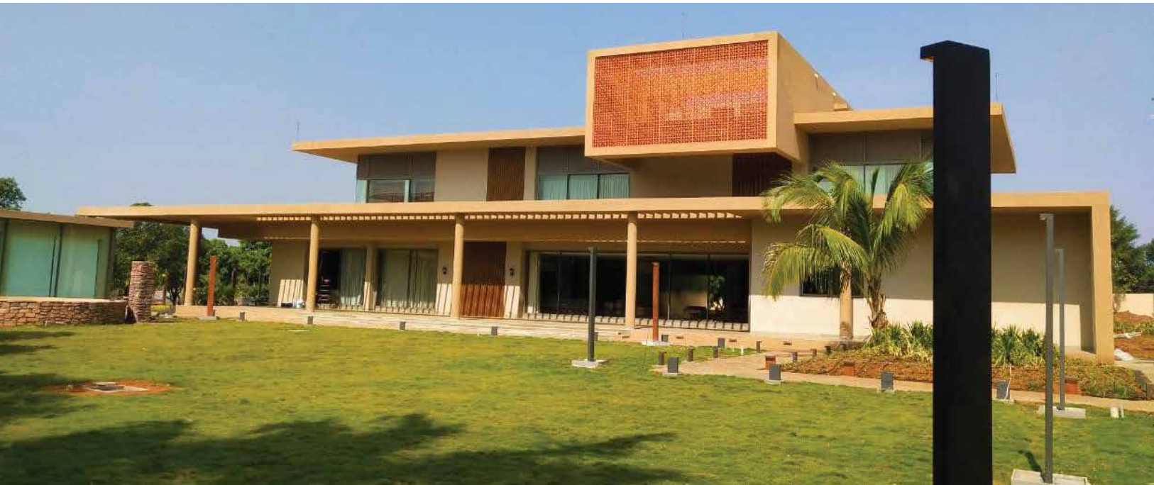
RELIANCE GIR, JUNAGADH, AHMEDABAD