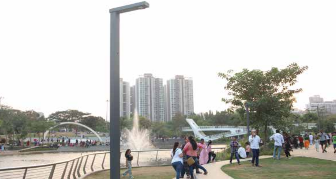
NAMO GRAND CENTRAL PARK, THANE