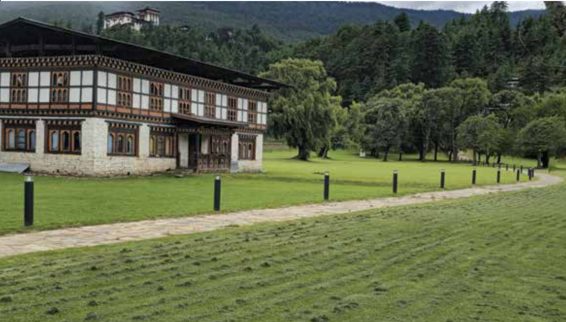
WANG PALACE, BUMTHANG, BHUTAN