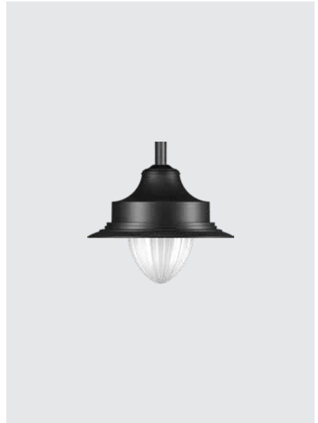
A12 - Clear Polycarbonate