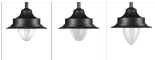
A8 - Translucent Acrylic