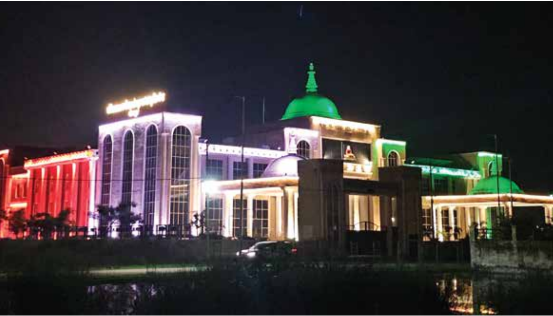
YOGI RAJ BABA GAMBHIRNATH HALL, GORAKHPUR