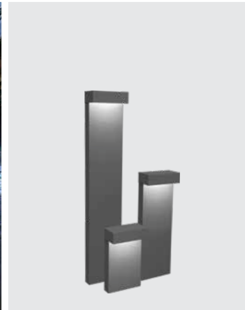
RITZ CARLTON, PUNE