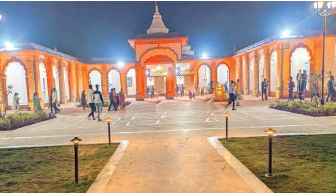
MAA SAMALESWARI TEMPLE, ODISHA