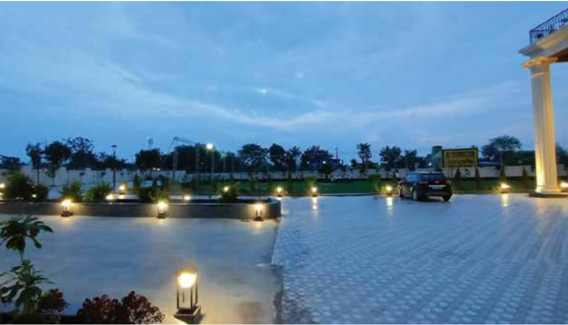
THE RAMAYANA HOTEL, AYODHYA