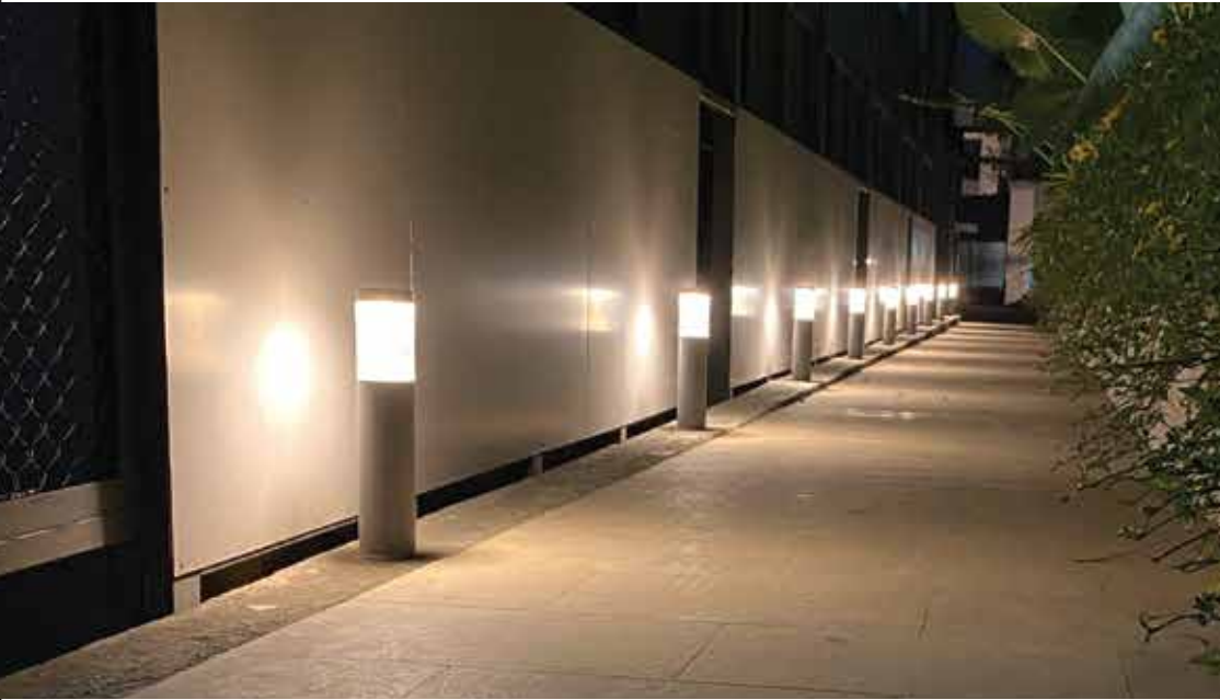
VR MALL, CHENNAI