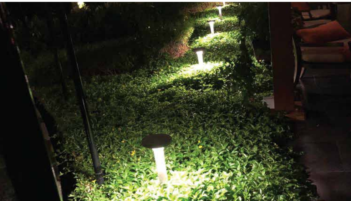
PARK HYATT, CHENNAI