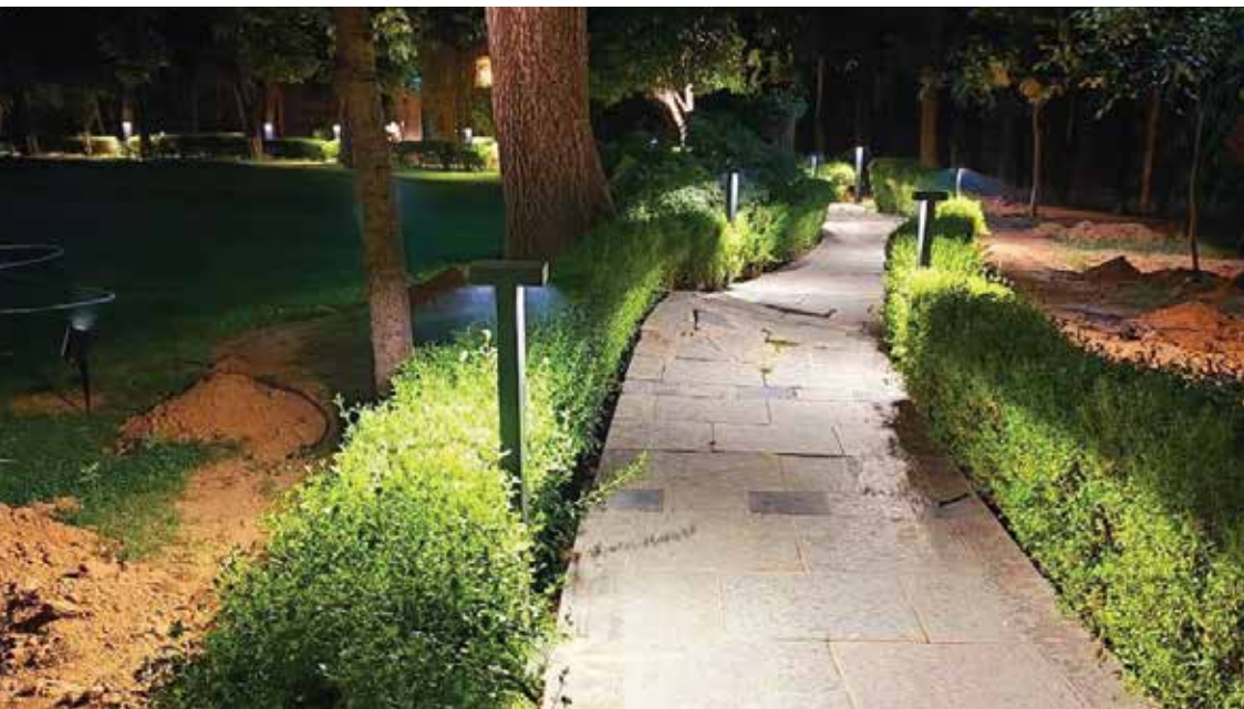
PRIVATE FARM HOUSES, DELHI