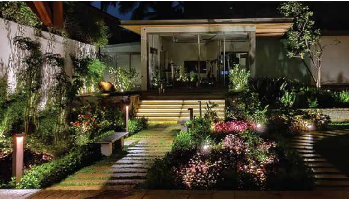
PRIVATE RESIDENCE, BENGALURU