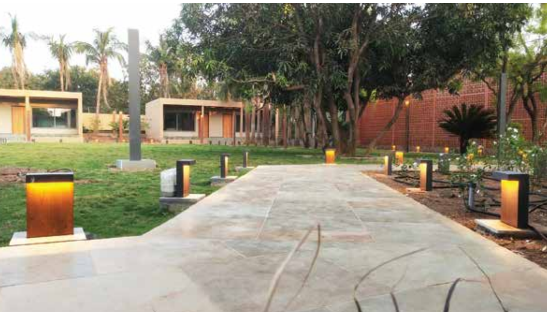
RELIANCE GIR, JUNAGADH, AHMEDABAD